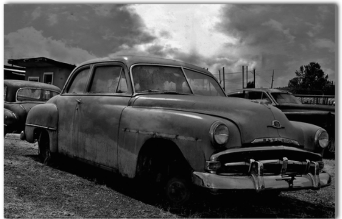
"Cloud Mobile" By Chris Garza

Organically Grown Company * Sno Temp Cold Storage * Lochmead Dairy * Springfield Creamery * Camp Baker * Café Mam * Toby's Family Foods * The Bread Stop * Market of Choice 29 th Street * UO Duck Store * Capella Market * Costco * Bi-Mart