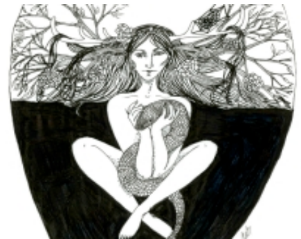
Birth of Inspiration by Ashley Munkres

My dreams follow an Ariadne thread through a maze of cement tunnels, staircases into the depths of subway stations, and bleary windows. In my dream memory is an aerial map of where to go next. The presence of people (Them) is implied but invisible. The color scheme and atmospheric quality are the real characters.